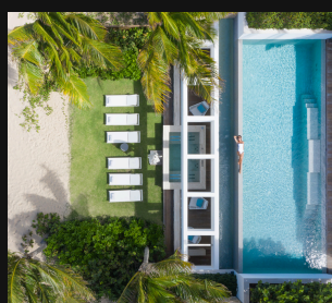
Villa Wake Up, St Barths STATEMENT VILLA