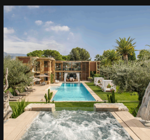
Villa Casa Ventura, Saint-Jean-Cap-Ferrat STATEMENT VILLA