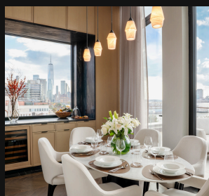
Maison Hudson, New York RESIDENTIAL HOTEL