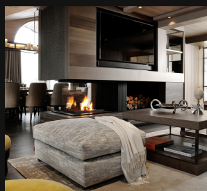
L'Empyrée 1850, Courchevel DUPLEX PENTHOUSE