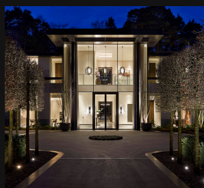
Woodhaven, St Georges STATEMENT VILLA