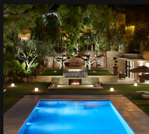
Villa L'Empyrée STATEMENT VILLA