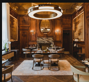
Maison Villeroy, Paris RESIDENTIAL HOTEL